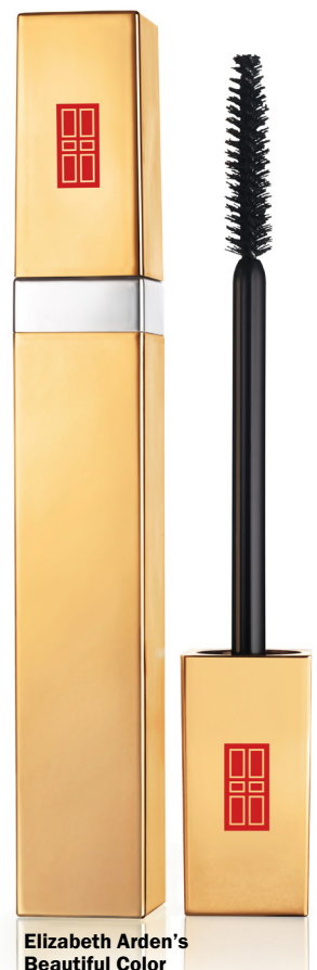
Elizabeth Arden's Beautiful Color

Oscar de la Renta and Thakoon showcased rich espresso shadows on the eyes that are wonderfully easy to wear and appropriate for all skin tones. Elizabeth Arden can help you achieve the look in a cinch with the Chic Browns Eyeshadow Quad from their new limited edition Untold collection. I was running to an event the other day and needed to do a seriously fast day-to-evening turnaround, so I quickly smudged the chocolate brown all over my eyelids and underneath my lower lashes at the corners, and I was ready to roll in under 5 minutes! For a different take, leave your eyelids totally clean and only lightly trace color along the outside corner of the top lash-line and more heavily underneath the lower eyelashes. The brown in the Chic Browns quad is warm enough to suit everyone and the compact is the perfect day-to-evening transformer for women on the go. Pop a touch of the pale gold highlighter on the inside corners of your eyes at the tear duct, finish off with one of my favorite mascara's by Tarte , Lights, Camera, Lashes and hey presto!