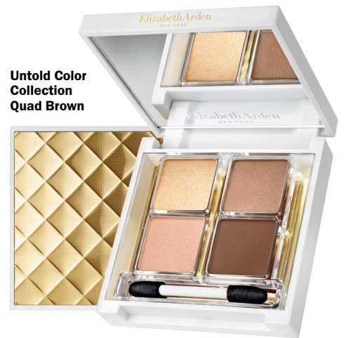
Untold Color Collection Quad Brown

Oscar de la Renta and Thakoon showcased rich espresso shadows on the eyes that are wonderfully easy to wear and appropriate for all skin tones. Elizabeth Arden can help you achieve the look in a cinch with the Chic Browns Eyeshadow Quad from their new limited edition Untold collection. I was running to an event the other day and needed to do a seriously fast day-to-evening turnaround, so I quickly smudged the chocolate brown all over my eyelids and underneath my lower lashes at the corners, and I was ready to roll in under 5 minutes! For a different take, leave your eyelids totally clean and only lightly trace color along the outside corner of the top lash-line and more heavily underneath the lower eyelashes. The brown in the Chic Browns quad is warm enough to suit everyone and the compact is the perfect day-to-evening transformer for women on the go. Pop a touch of the pale gold highlighter on the inside corners of your eyes at the tear duct, finish off with one of my favorite mascara's by Tarte , Lights, Camera, Lashes and hey presto!